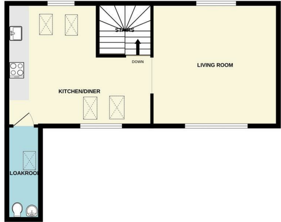
SECOND FLOOR 542 sq.ft. (50.4 sq.m.) approx.